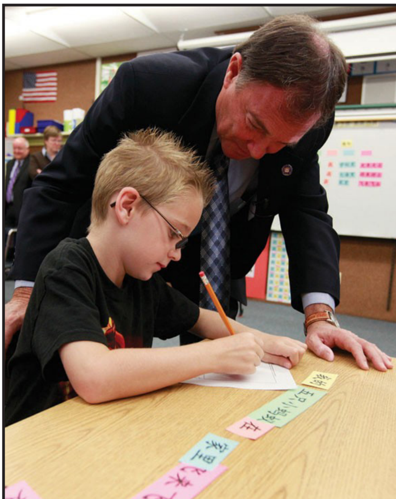
Utah Governor Gary Herbert, visiting a Chinese DLI classroom.