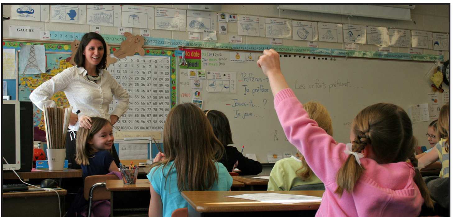
Utah Dual Language Immersion classroom.

The Utah Dual Language Immersion Program then offers one course in grades seven through nine, and additional outside the classroom opportunities. Participating students are expected to enroll in Advanced Placement language coursework and complete the AP exam in the ninth grade. In grades ten through twelve, students will be offered 3000 university-level coursework through blended learning with six major Utah universities. Students are also encouraged to begin study of a third language in high school. Through this articulated K-12 Utah language roadmap, the state's students will enter universities or the global workforce equipped with truly valuable language and cultural skills at the Advanced Level of proficiency in all four skill areas (reading, writing, speaking and listening).